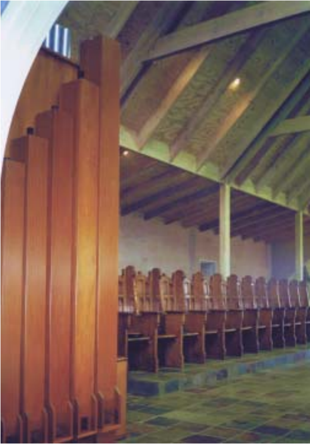
View of the Abbey Church